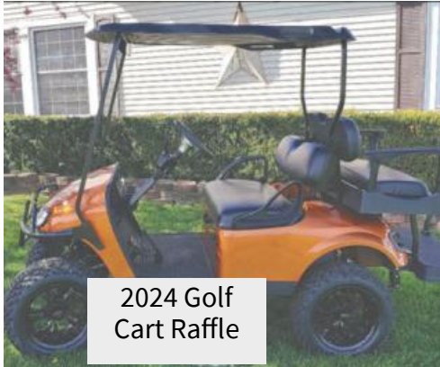
2024 Golf Cart Raffle